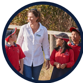
Build skills through fun