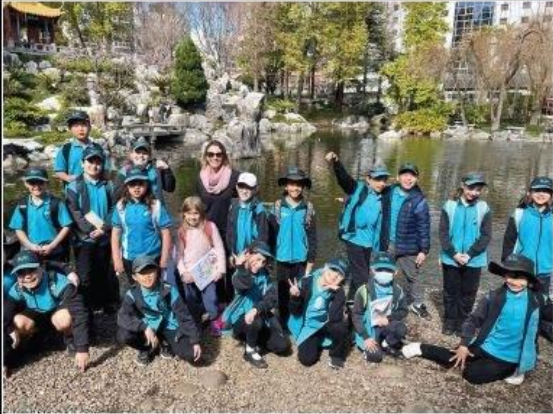
3/4K enjoying the landscape in the Chinese Garden of Friendship