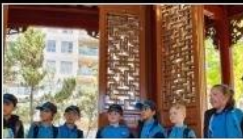
4BK students playing Chinese Whispers