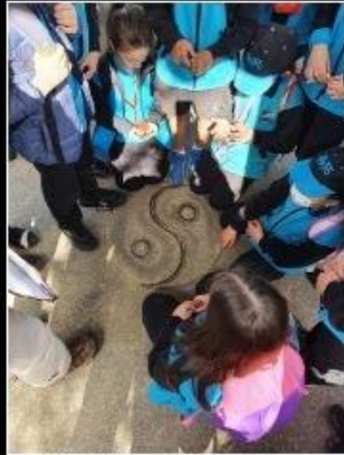
3/48 enjoying their excursion around Chinatown and the Chinese gardens