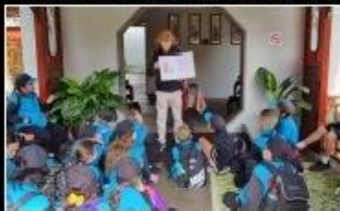
4BK listening to the tale of the Chinese Zodiac

Stage 2 recently visited Chinatown and the Chinese Garden of Friendship in Darling Harbour. The day supported our Geography unit where we are learning about the Earth's environment, in particular the natural vegetation and animals found in China.