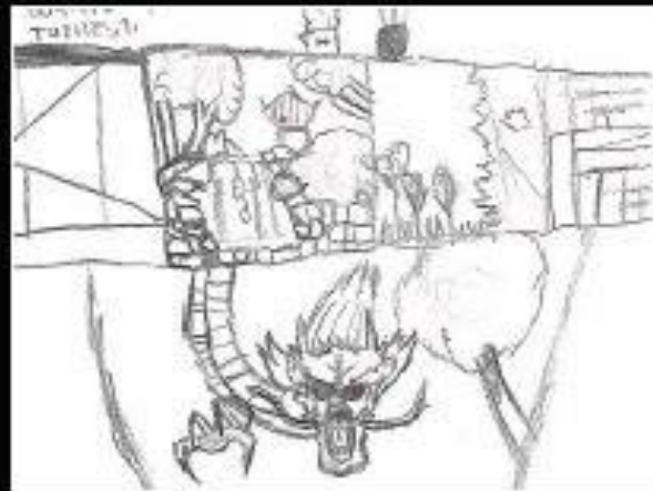
Isaiah was inspired to sketch this scene