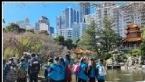
4BK in the Chinese Garden of Friendship