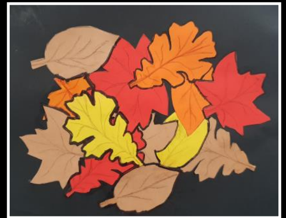
Artwork by Reda

Tumbling, Twirling, Dancing, Autumn leaves, Skimming the ground, Daintily. Orange, red and gold, Scattered across the paths. Chilly wind, Billowing at helpless trees, Stripping them of their leaves. Tumbling, Twirling, Dancing, Autumn leaves.