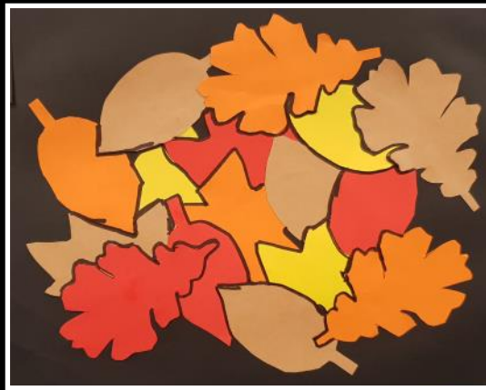
Artwork by Emily

The fallen leaves crunched and rustled, As I strolled across the empty park. It was so quiet, You could hear the cool breeze, Blowing through the trees. Brown and yellow leaves, Blanketed the deserted land. The lonely, naked trees looked helpless, Finally, autumn had arrived.