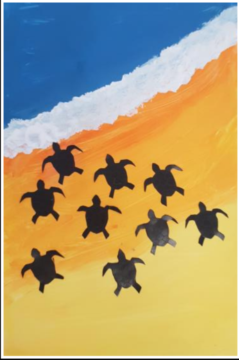
Hang— One in a Thousand