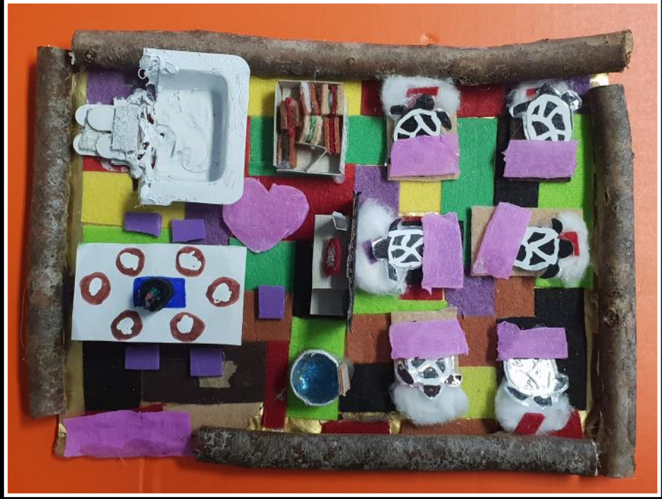
Amina— Turtle Rookery (above) Jellyfish (below)