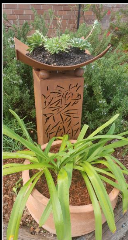
New garden feature with succulents