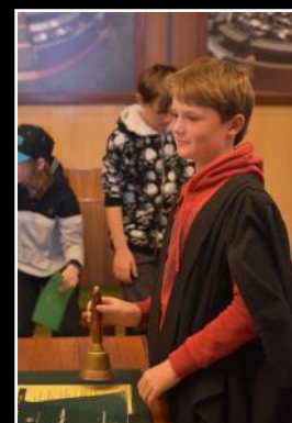
The Sergeant-at-Arms places the Mace to open Parliament and the Clerk does the first reading of the proposed Bill.