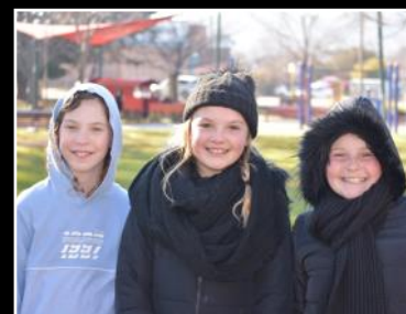
Morning Tea & comfort stop—Belmore Park Goulburn