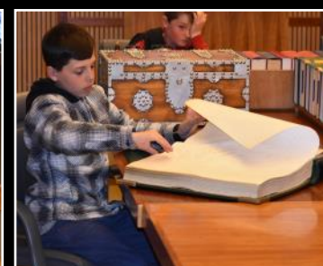
The Speaker runs the debate while the Prime Minister checks the Constitution.