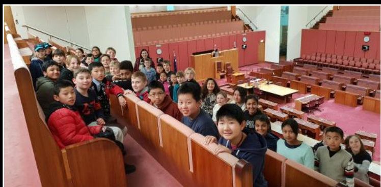
Tour of the Senate