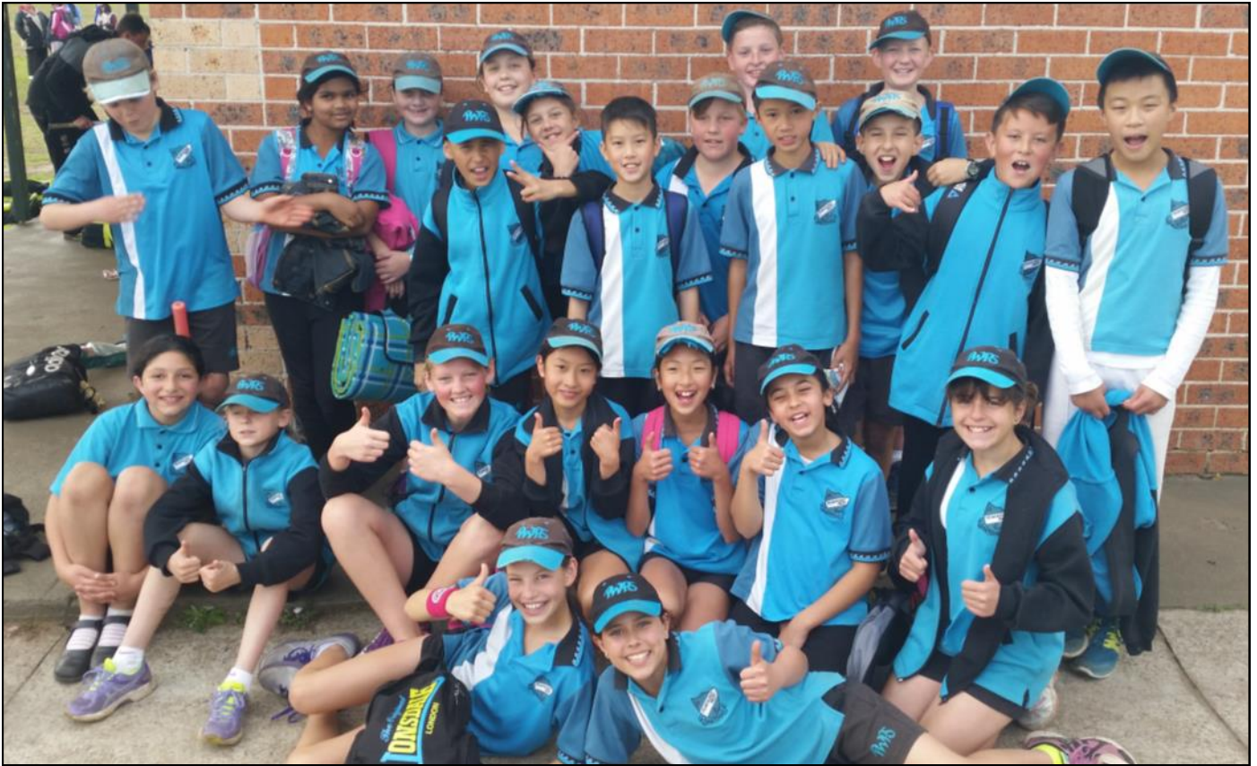
Both teams after the finals