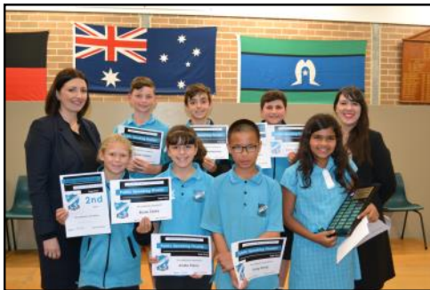
Finalists Stage Three