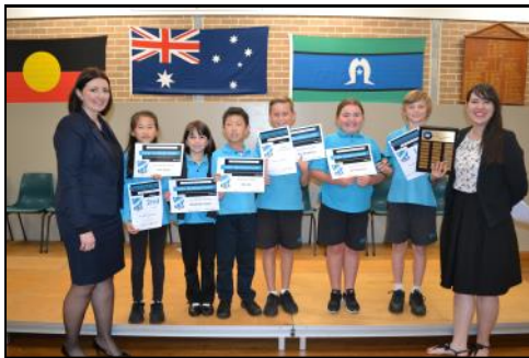
Finalists Stage Two