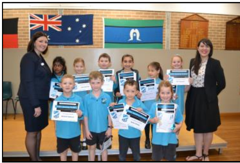
Finalists Stage One (back) Stage One (front)