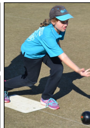
Learning new skills