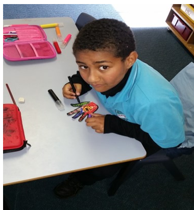
In class learning before their SISA session.