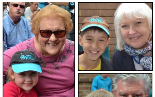
Students with our VIPs